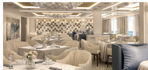
The Haven Restaurant