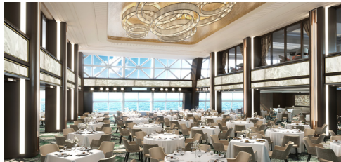
The Manhattan Room