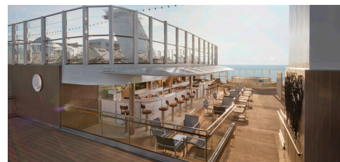
Vibe Beach Club

Deck 20: Seating capacity 115; Reception capacity: 138