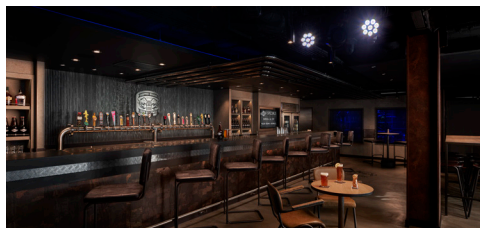
The District Brew House

Seating capacity: 104; Reception capacity: 107