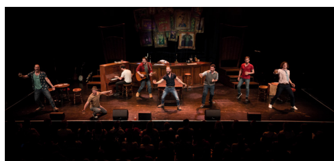
The Choir of Man

Raise your glass to high-energy dancing and hit songs that flow as freely as the beer. You'll feel right at home in The Jungle, the rockin' English pub where the talented cast performs everything from classic rock hits and pub tunes to sing-along favorites.