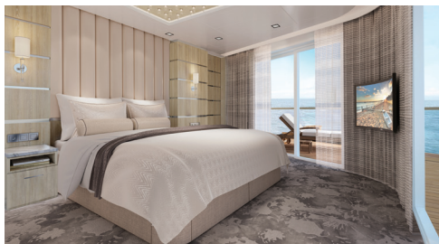
The Haven Deluxe Owner's Suite with Large Balcony