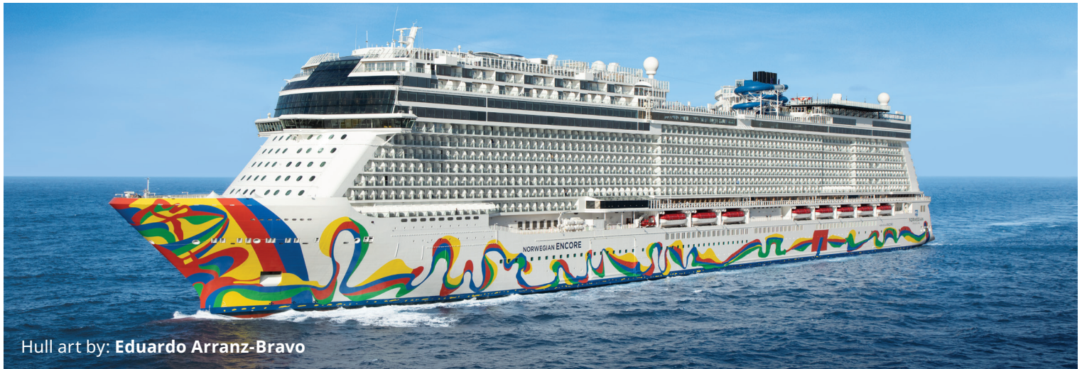
Hull art by: Eduardo Arranz-Bravo

Built: 2019 • Gross Tonnage: 169,116 • Guests (Double Occupancy): 3,998 • Overall Length: 1,094 feet • Max Beam: 136 feet • Crew: 1,735