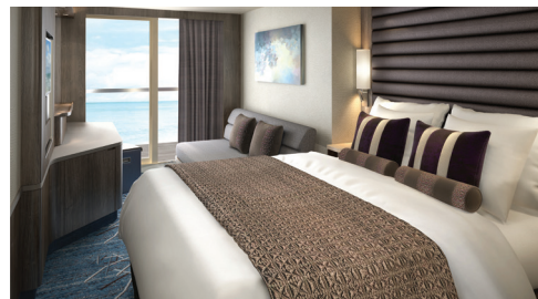
Club Balcony Suite