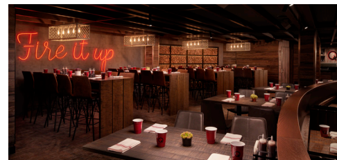
Q Texas Smokehouse