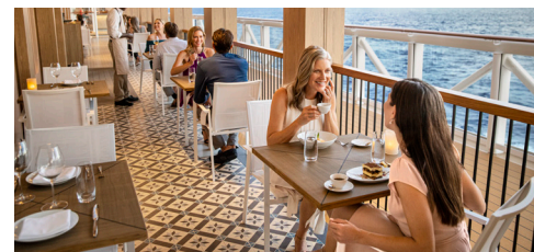
Onda by Scarpetta, The Waterfront

Seating capacity: 108 Indoor; 44 Waterfront