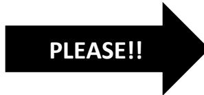
TABLE SECTION FOR THESE MATCHES

When Your Matches Have Completed, Please Return This Sheet to The Front Table!!!!